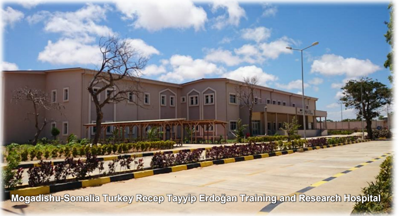
Mogadishu-Somalia Turkey Recep Tayyip Erdoğan Training and Research Hospital