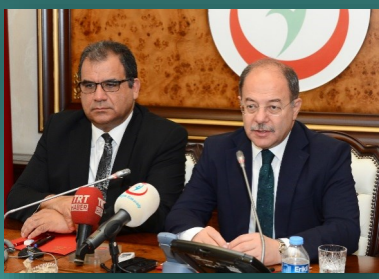
Visit of Dr. Faiz Sucuoglu, Minister of Health of TRNC